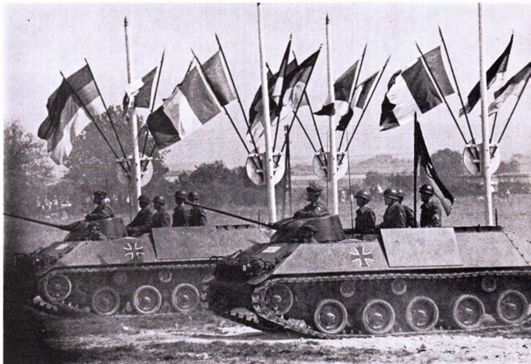
German armored cars parade at Mourmelon, France, for General de Gaulle and Chancellor Adenauer. Notice the French and German flags flying side-by-side less than 20 years after World War II.

When our people have learned their lesson, and repented of their sins and quit breaking God's law—the Ten Com-